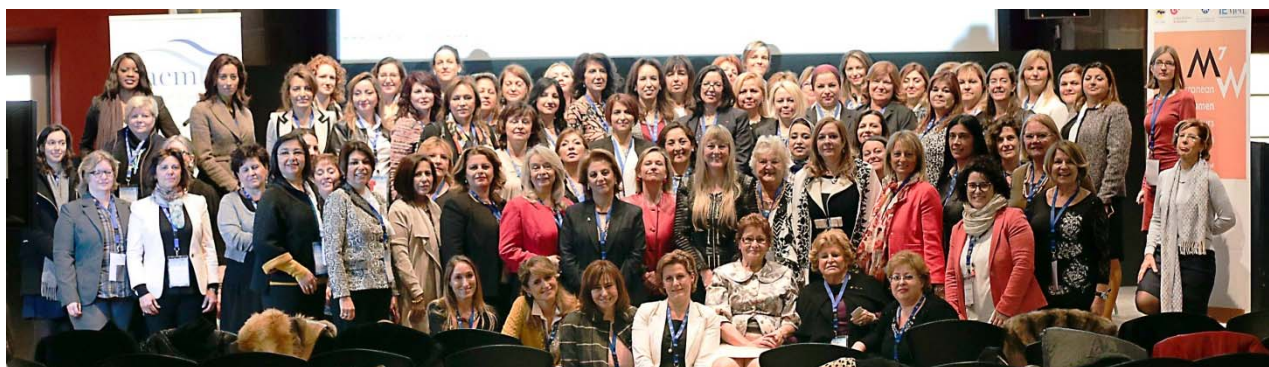
Some of more than 200 businesswomen and women entrepreneurs from different Mediterranean countries attending the Forum

THE VIII MEDITERRANEAN WOMEN ENTREPRENEURS FORUM WILL TAKE PLACE IN APRIL 2016, IN EL CAIRO (EGYPT)