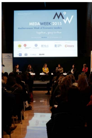
The panel on the role of public authorities in Promoting Women entrepreneurship