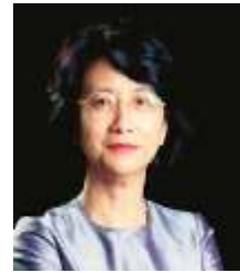
HON. ING. KANTHA PHAVI Minister for Women's Affairs (Cambodia)