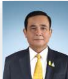
H.E. GENERAL (RET.) PRAYUT CHAN-O-CHA Prime Minister of Thailand