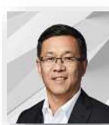
CHUNYUAN GU President, Asia, Middle East, Africa, ABB Ltd (Sweden)