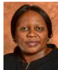
HON. NOMALUNGELO GINA Deputy Minister of Trade and Industry (South Africa)