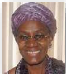
HON. MARIE THERESE ABENA ONDOA Minister for Women's Empower- ment (Cameroon)