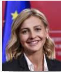
HON. NINA ANGELOVSKA Minister of Finance (North Macedonia)