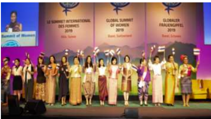
Thailand's presentation at the 2019 Summit in Switzerland participants to 2020 Summit in Bangkok