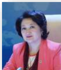
HON. AKTOLY RAIMKULOVA Minister of Culture and Sports (Kazakhstan)