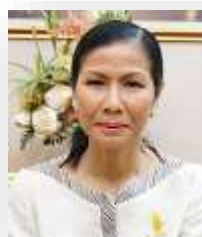
KOBKARN WATTANAVRANGKUL Chair, Toshiba Thailand; Former Minister of Tourism and Sports (Thailand)