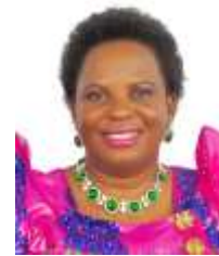
HON. BETTY AMONGI Minister for Lands, Housing and Urban Development (Uganda)