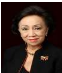
HON. DELIA DOMINGO- ALBERT Former Secretary of Foreign Affairs (Philippines)